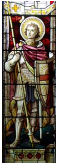
The newly restored St George from the west window (St George's day is 23 April).